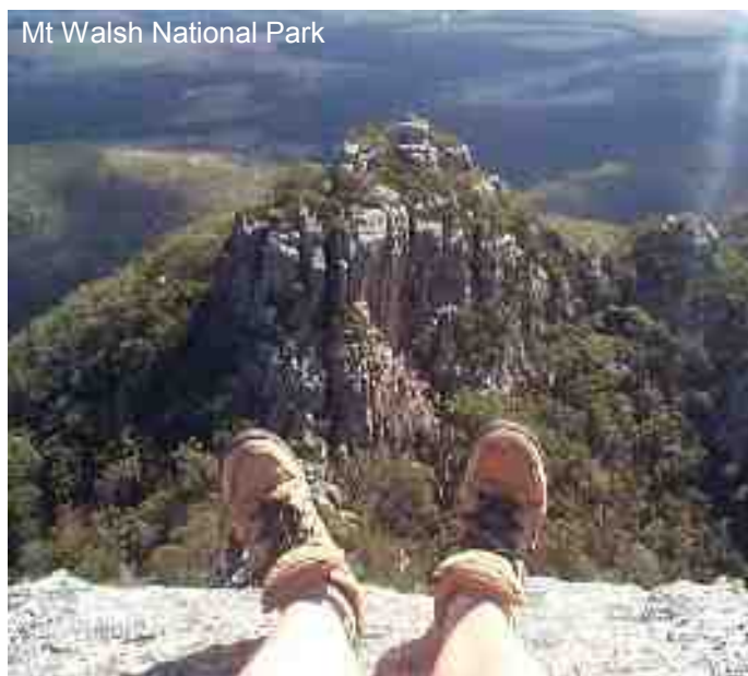
Mt Walsh National Park

The Goodnight Scrub preserves Australia's largest Hoop Pine forest, as well as featuring dry rainforest pockets and unusual Queensland Bottle Trees amidst a classic Australian bush surround. The Burnett River meanders through cliffs and sandy beaches - great for swimming in summer - and a lookout offers stunning views to the western mountains and across the Bundaberg plains. Kangaroos and wallabies are a common sight in the area.