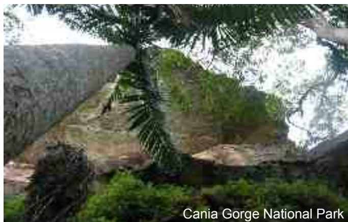
Cania Gorge National Park

Just north of Monto, spectacular sandstone cliffs rise above deep rainforest gullies carved by running water in a cooler and wetter era. An abundance of wildlife calls the gorge home - as have bushrangers and gold miners in our pioneer days. Well-formed paths and boardwalks open the beauty of the inner gorges to all ages and fitness levels. This park is one of Queensland's best for wildlife viewing.