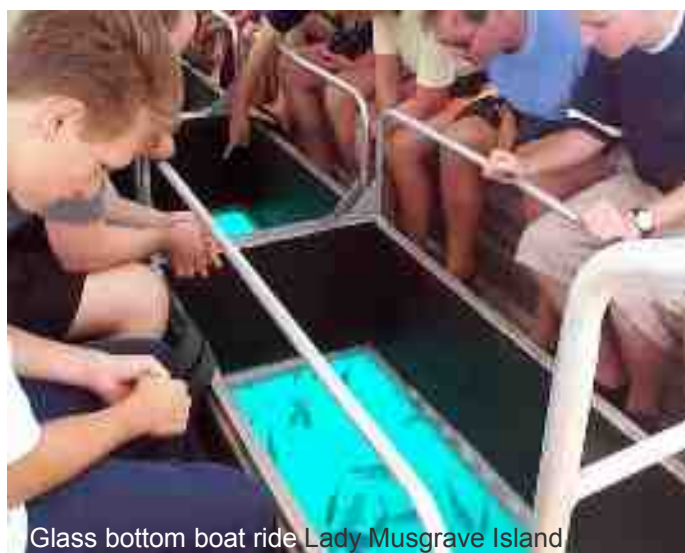
Glass bottom boat ride Lady Musgrave Island

The Artificial Reef is a must for visiting divers, situated approximately 3 nautical miles off the coast of Elliott Heads, only a fifteen-minute boat trip from Bargara Beach or a ten-minute trip from the Elliott River. It offers a variety of individual sites including; the 33 metre wreck of the 'Ceratodus II' (Sand Dredge), two Mohawk aircraft, King Air aircraft, water tower and a huge variety of specially constructed concrete modules, pipes and assorted other structures.