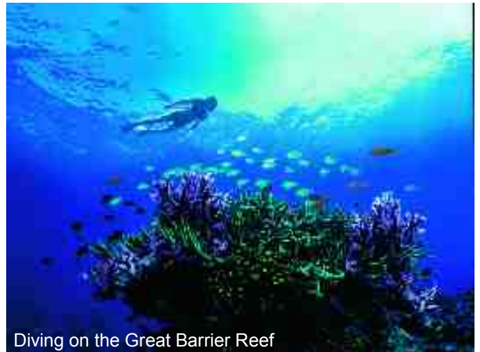
Diving on the Great Barrier Reef

Double Rock is a coastal reef just offshore that usually provides great visibility and a great variety of coral. See basalt rock, extensive soft and hard corals featuring magnificent plate and lettuce-leaf formations. It extends to about 100 metres from the shore and mainly to the north. A substantial and interesting bommie lies approximately 20 metres from the point of the seaward rock and slightly to the north.