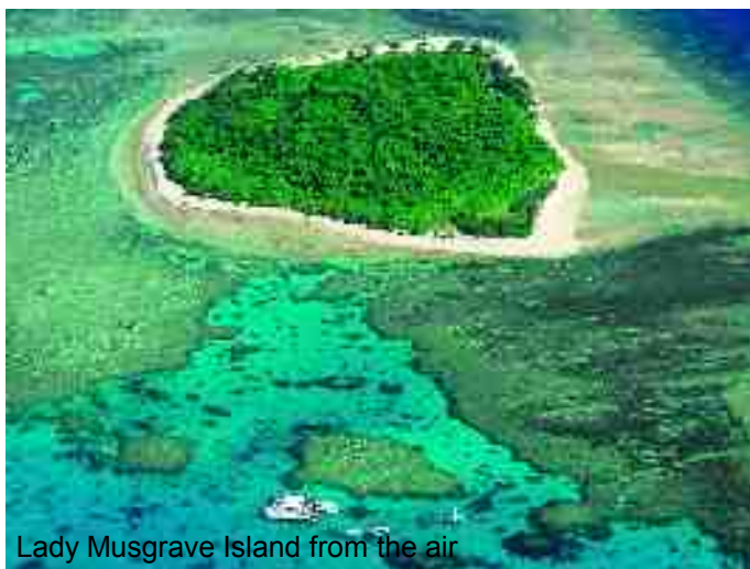
Lady Musgrave Island from the air

Lady Elliot Island is the most southerly island within the Great Barrier Reef Marine Park, lying 85 km (53 nautical miles) north east of Bundaberg. The diving here is superb, with 10 dive sites including Lighthouse Bommie, Coral Gardens, Moiri, and Shark Pool as well as numerous shipwrecks in the waters off the island. The visibility is excellent and ranges from 25 to 50 metres (80 to 185 feet). You can also simply walk around the island and dive straight from the beach.