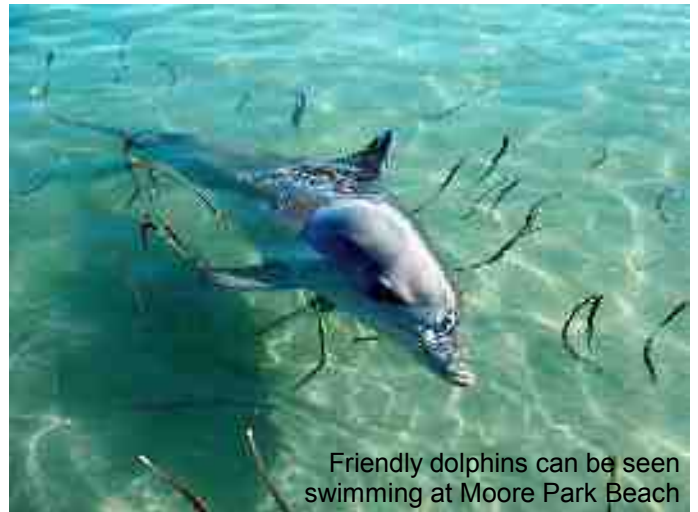
Friendly dolphins can be seen swimming at Moore Park Beach

Dugongs ( Dugong dugon ) have a protected home at Rodds Harbour in Miriam Vale Shire. It is now a designated sanctuary and these mysterious mammals can sometimes be seen when exploring the maze of waterways.