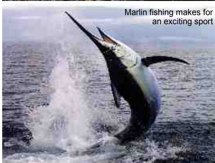
Marlin fishing makes for an exciting sport

Native to the Mary and Burnett Rivers, the very rare Lungfish is now an endangered species. A monument to this remarkable creature can be found in the Bundaberg Riverside Parklands , an interpretive metal sculpture of a ceratodus by John Olsen.