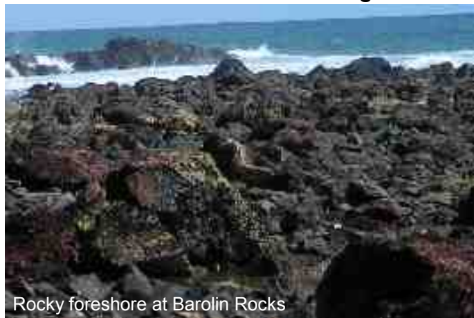
Rocky foreshore at Barolin Rocks