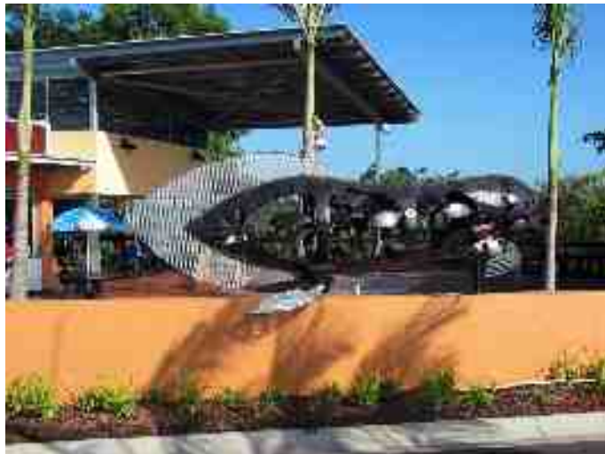
Lungfish sculpture at Riverside Parklands

Most of the beaches along the Coral Coast feature many smaller rock pools that support miniature eco-systems, ideal for study or just to satisfy curiosity. The best rock pools for viewing a variety of marine life – such as sea anemones, crustaceans, small fish, etc. – can be found at Barolin Rocks and Bargara .